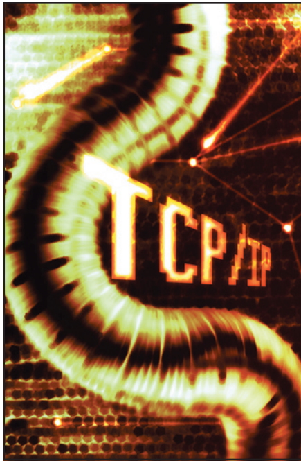
Navigating the VoIP maze with technology from Orchid.

Voice over Internet Protocol is a rapidly emerging telecommunications technology with great promise. Orchid Technologies performed the electronics design of this early VoIP hardware solution for an emerging provider of telecommunications equipment. Hired to 'get it working yesterday' , Orchid delivered prototype units in ten weeks from project start.